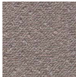
Fabric: Wilshire WB #3