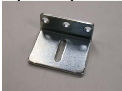
Filler post to ceiling track bracket