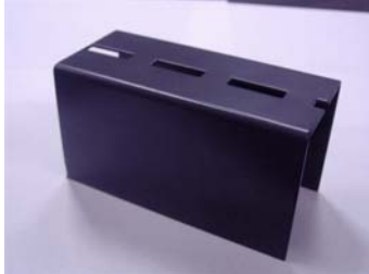
Ceiling track / Wall starter