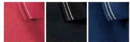
Sunset Red/Khaki/Black Jet Black/Ivory/Khaki Navy/White/Stone