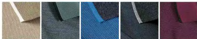
Khaki/Ivory Cypress/Black Blue/Blue Charcoal/Light Grey Burgundy/Black